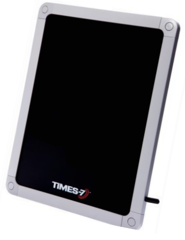
The SlimLine A6031

RFID Solutions www.rfidsolutionsinc.com sales@rfidsolutionsinc.com (561) 271-1727